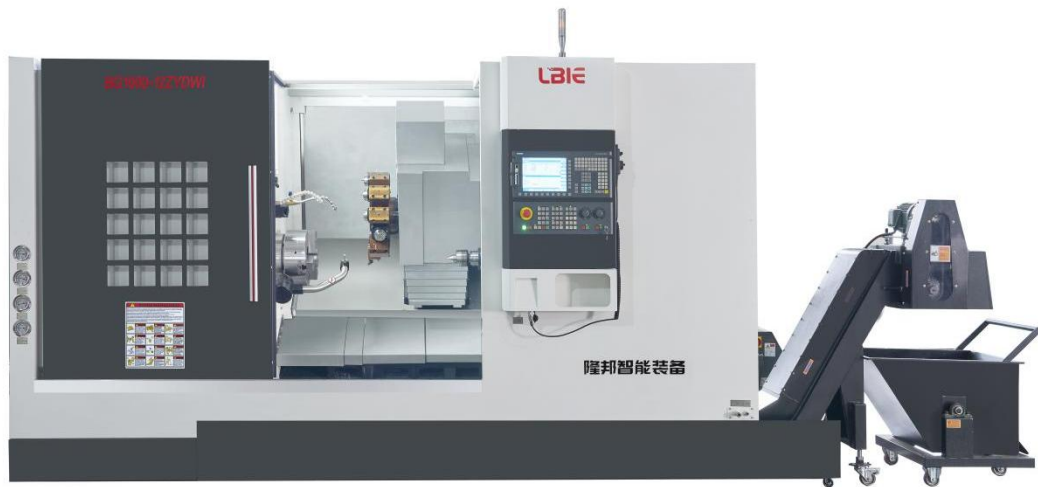
Figure 1: Appearance Display (Pictures for Reference Only)