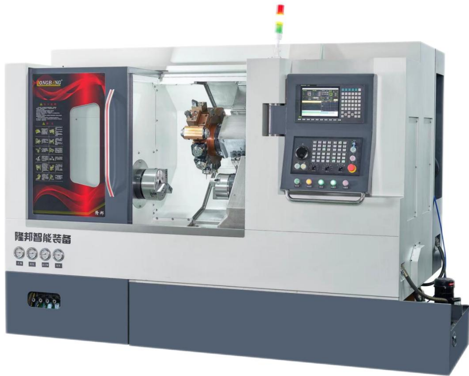
Figure 1: Appearance Display (Pictures for Reference Only)