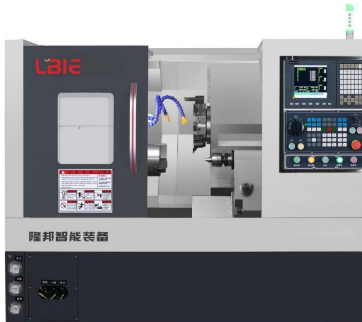
Figure 1: Appearance Display (Pictures for Reference Only)